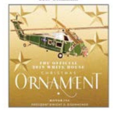
The White House Historical Society 2019 Ornament

Again, my thanks to everyone for going all out and purchasing "that cute little White House helicopter" for decorating and giving. This is our one annual fundraiser and members' support was impressive.