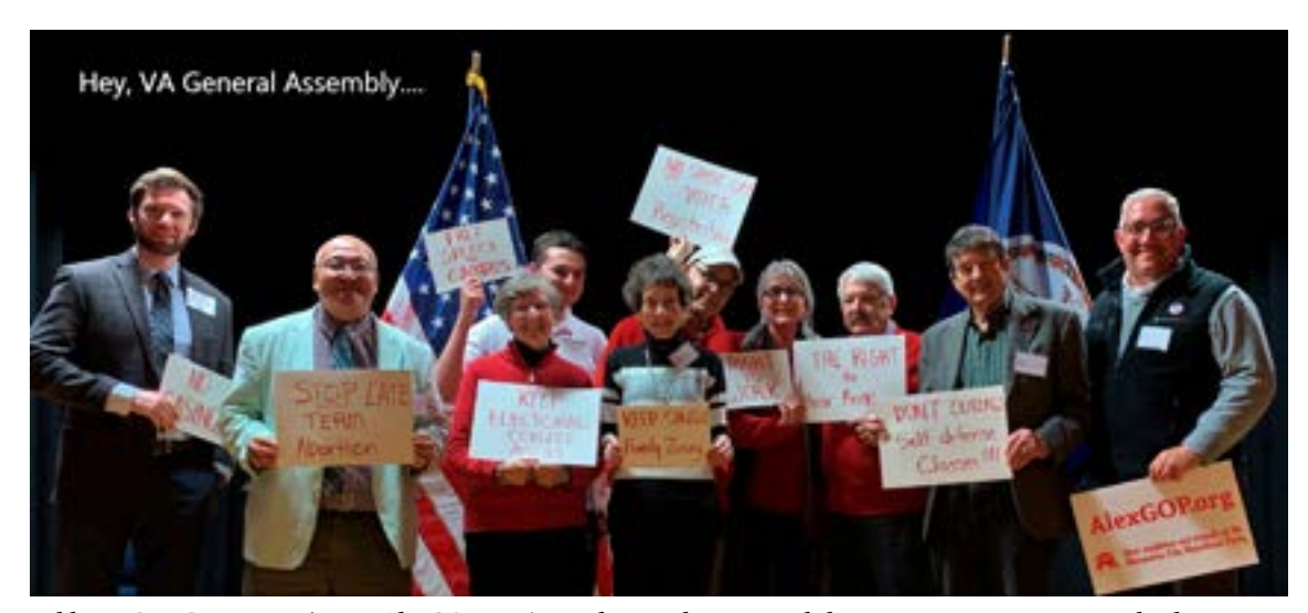
Alexandria Republican City Committee (www.AlexGOP.org) members and guests used the January 2020 meeting to display opinions on a variety of issues on their minds and currently being discussed in Virginia's 2020 General Assembly. Signs say: No Casinos; Stop Late Term Abortion; Free Speech on Campus; Keep Electoral College AS IS; Keep Single Family Zoning; NO Same Day Voter Registration; Right to Work; The Right to Bear Arms; and Don't Outlaw Self-defense Classes.

Panel Reports CRWC's Strategic Planning for 2020 & VA Legislative Session Report